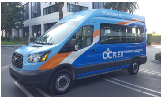
Figure 2: Example Passenger Van Shuttles

The Bustang Mountain Corridor Shuttle Plan proposes to use a fleet of passenger vans. Because the proposed vehicles are smaller than the standard Bustang over-the-road coaches, the service will be allowed to operate in the I-70 Mountain Express Lanes (MEXL) through Clear Creek County, avoiding traffic congestion in the general purpose lanes in the east- and west-bound directions, as well as on the potential bus-on-shoulder stretch on Floyd Hill. These smaller vehicles also will eliminate the need for CDL certification, making it easier to find drivers and maintain a better level of service for the public. Finally, the vehicles require lower-cost liability insurance and less costly maintenance compared to over-the-road coaches and buses. Figure 2 shows examples of existing passenger van shuttles, including OC Flex through Orange County Transportation Authority (OCTA) in California and Ride 2 through King County Metro in Washington State.